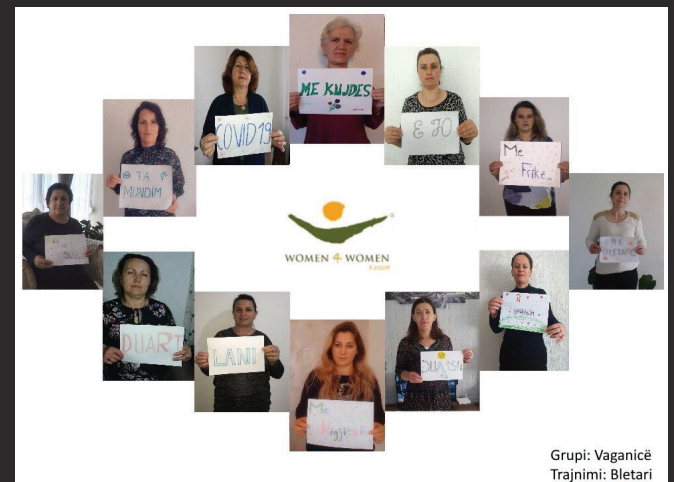
Grupi: Vaganicë Trajnimi: Bletari

Within project 'Integrated Social and Economic Empowerment for Marginalized Women in Kosovo', supported by Cartier Philanthropy and also through funds granted by Women for Women International, we have transitioned to virtual collaboration with 249 participants in various municipalities throughout Kosova. The key activity for this period includes awareness raising campaign of Covid-19 by providing women information about disease prevention and sharing photos of the participants with the messages. The trainers prepared the "Crisis Curricula" with the topics: Economic crisis; Healthy food; Family violence; Savings; and Stress during Covid -19